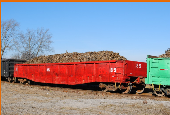
Koppel Steel frag car #85 & #21