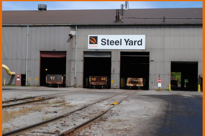
Old Steel Yard