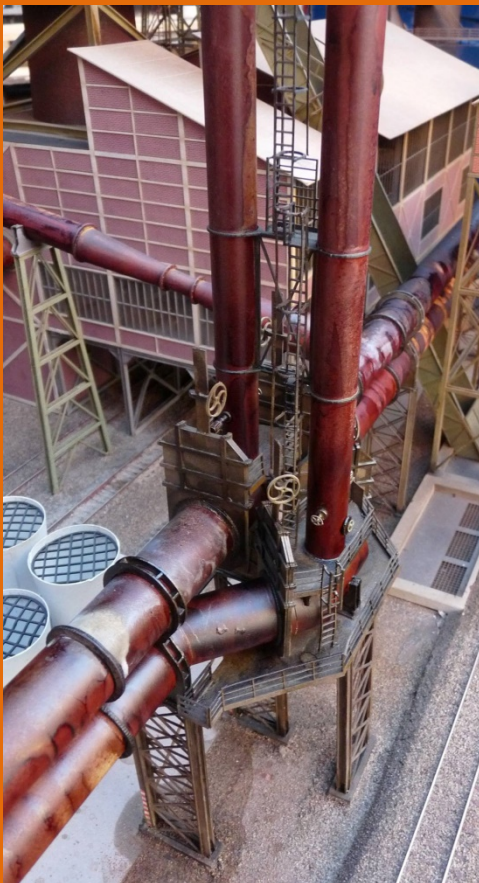
Jorg Schmidt Blast furnace Piping & detail